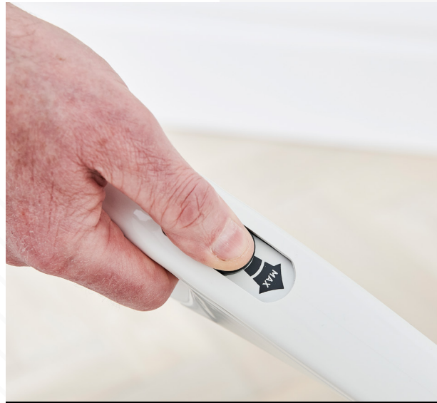
On/Off switch with integrated variable power