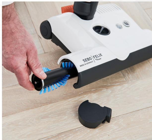
Easily removable brush roller