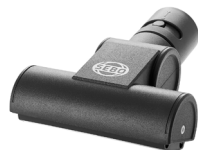
STAIR AND UPHOLSTERY TURBO BRUSH