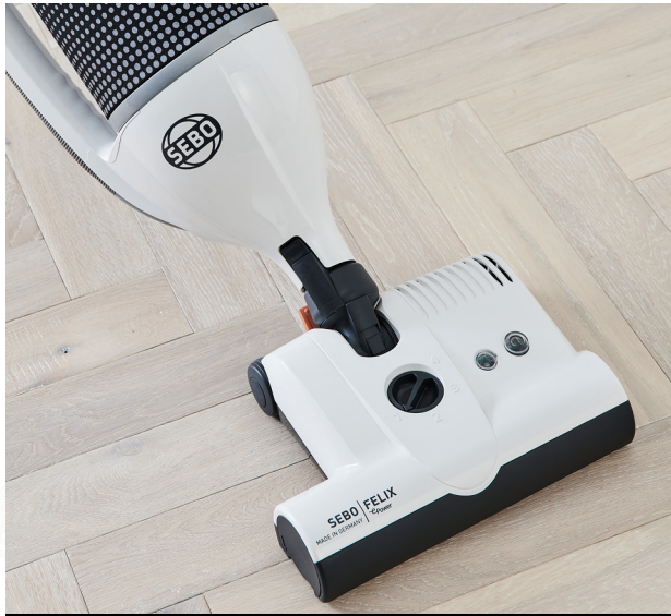
Highly manoeuvrable swivel neck