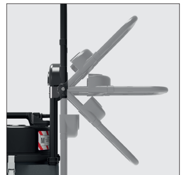
Folding Handle for Excellent Maneuverability