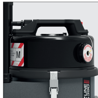
All-steel Head Construction (M-Class)