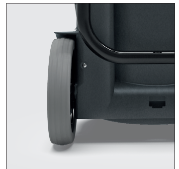
Large Rear Wheels are All-terrain Ready