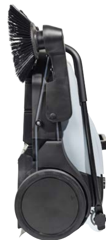
The hopper remains in place even when the sweeper is stored in an upright position or hung on the wall