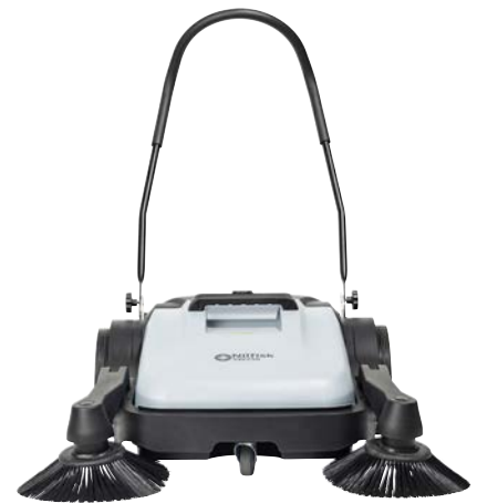
SW200 with one side broom – and SW250 with two side brooms – cover working widths of 70 cm and 90 cm.