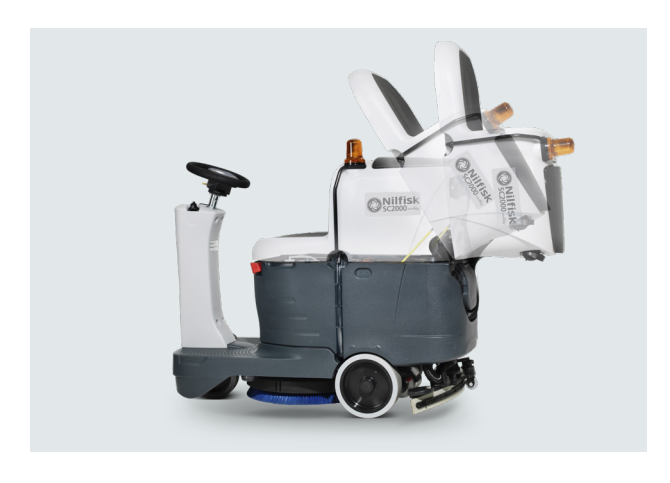
Full-tilt recovery tank provides easy access to battery compartment and Ecoflex system