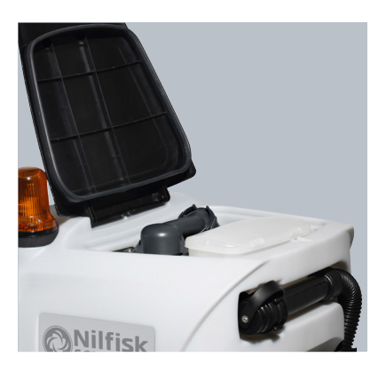
Fully removable recovery-tank lid for easy cleaning