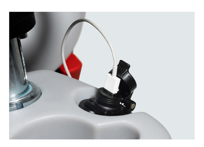
Optional USB port for device-charging