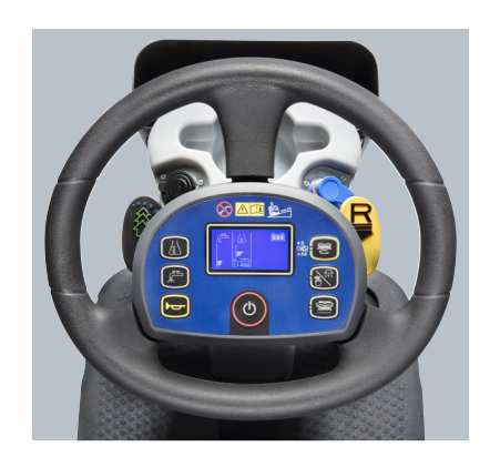
Intuitive dashboard with One-Touch button and built-in LCD display