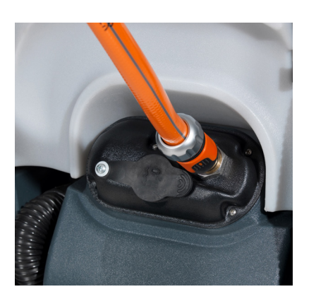
Filling system with automatic shut-off once tank is full (optional)