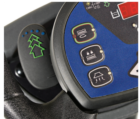
One paddle activates & de-activates the Ecoflex system