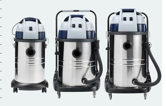
Available in 3 different sizes: 35 ltr., 55 ltr. and 75 ltr.

Specifications and details are subject to change without prior notice.