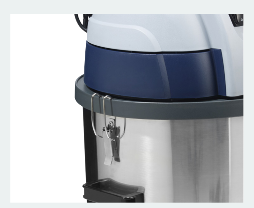
Locking mechanisms are designed for single handed use

The VL100 is fully compatible with the range of accessories offered with the rest of the Nilfisk Dry canister vac portfolio, allowing easy interchangeability and reducing the overall operating costs of your complete Nilfisk cleaning solution. A good and reliable choice for contract cleaners, institutions, hospitality and retail.