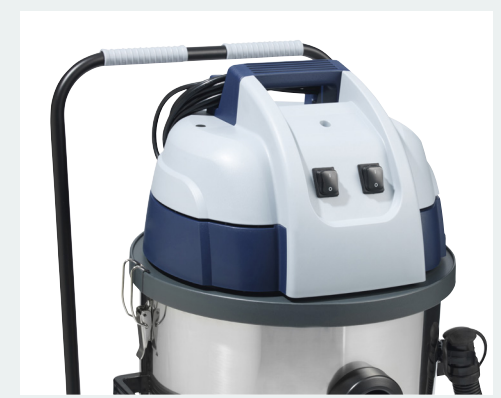
Dual or single motor