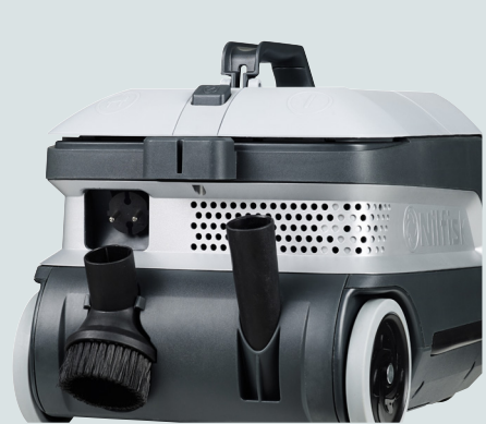
User friendly and easy to reach accessories