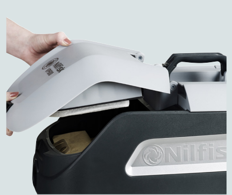
Magnetic hinges securing high reliability